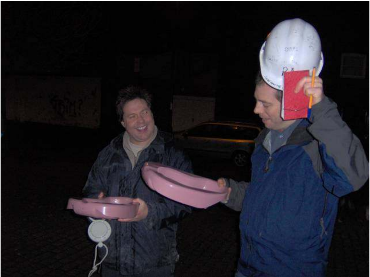
The remedials – BB with his BIG faced clock and AP with his no clock at all – still – if it means you get an extra hour in the pub, why bother with watches and clocks?